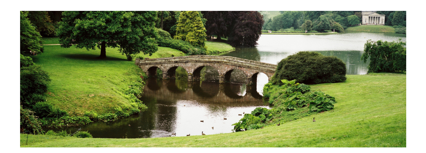
Listening Hearts 3