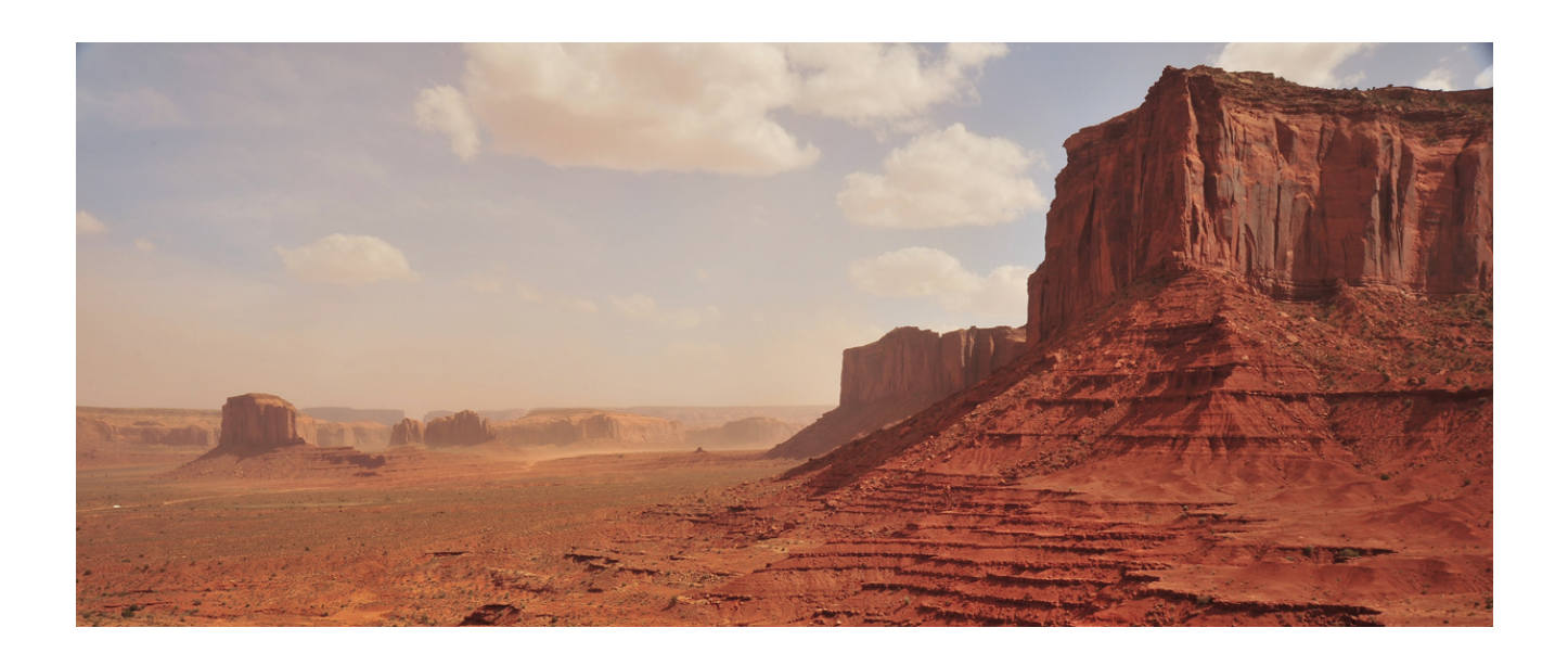
Listening Hearts 3