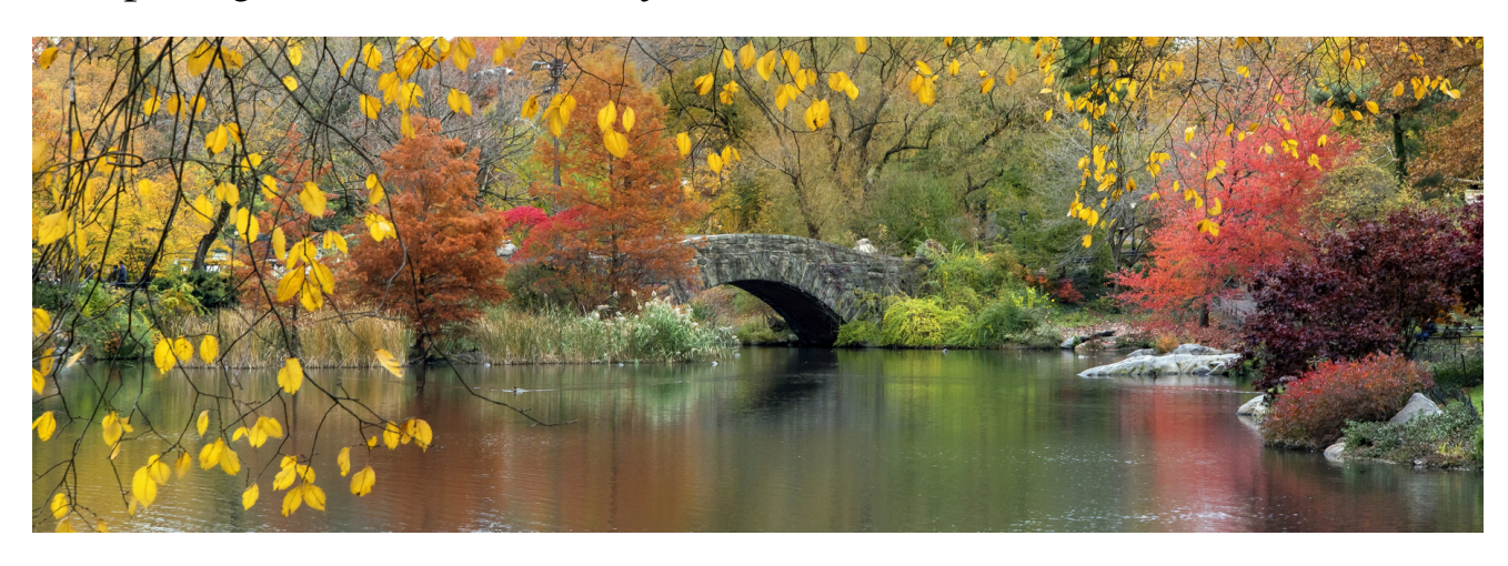
Listening Hearts 2