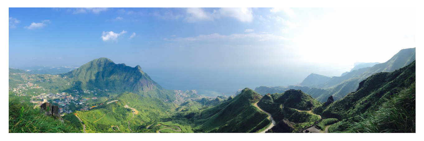
Listening Hearts 1