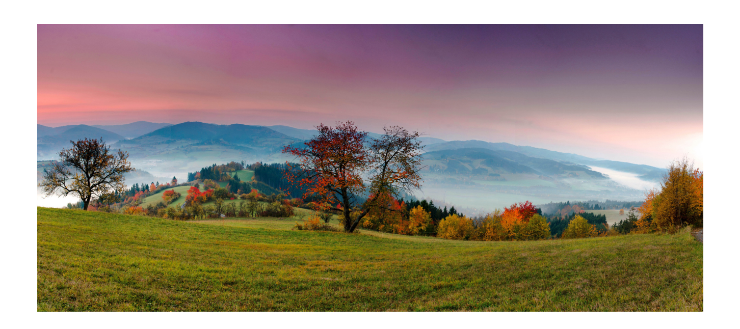
Listening Hearts 1

Set a timer with a gentle alert sound for one minute to be silent before God. As you continue to practice, you can slowly increase the time you spend in silence.