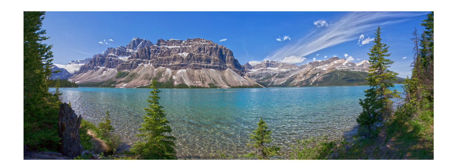
Listening Hearts 2