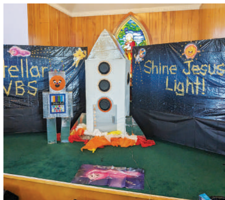
Seal Cove Baptist Church, Grand Manan, N.B.

Vacation Bible School is a system that allowed churches to give back to their communities, as most of the kids who participated in the programs were not primarily from the host church. We worked with different ages from 4 through 12, with groups ranging from 11 to 25 children per church. The "Stellar" VBS created a community for the older generation to mentor and guide the kids as many began their journey with Jesus and learned multiple ways to "Shine Jesus' Light," a theme they screamed with so much excitement that I'm confident the impact will remain for an extended time. I can attest that it impacted us as it kept ringing in our heads weeks after VBS. We animated many characters and stories from the Bible while inviting different "space characters" from our galaxies into the shining Jesus'