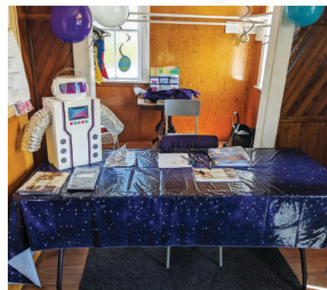
First Baptist Church, Hammonds Plains, N.S.