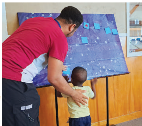
South End Baptist Church, Dartmouth, N.S.