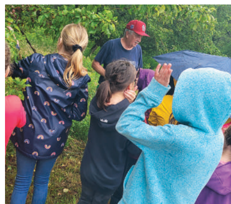
Nature walk at Camp Jordan, Shelburne, N.S.

some churches even had issues or situations occur that would have made it easy to push the VBS off till "next year." Yet they didn't let that stop them, and they went for it anyway. No matter their background or starting point, I was so encouraged by each team's response.