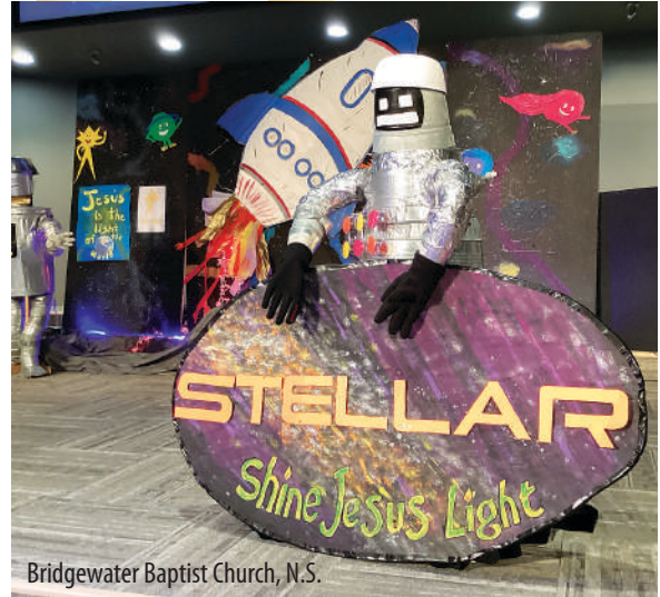
Bridgewater Baptist Church, N.S.

We had the responsibility of leading Vacation Bible School (VBS) in selected Baptist churches across Nova Scotia. The mission of Atlantic Baptist Women, in partnership with these churches, was to reach out to kids using the VBS program, "Stellar: Shine Jesus' Light." At first, we were