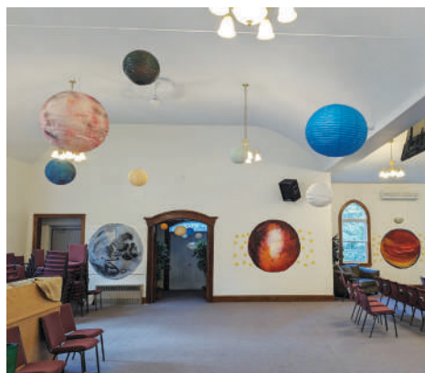
Grafton Baptist Church, N.B.