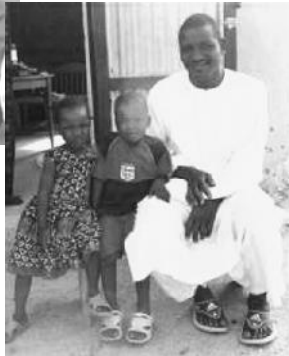
Below: Henjeb - my village father